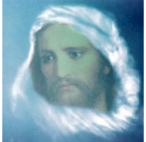
William Marrion Branham